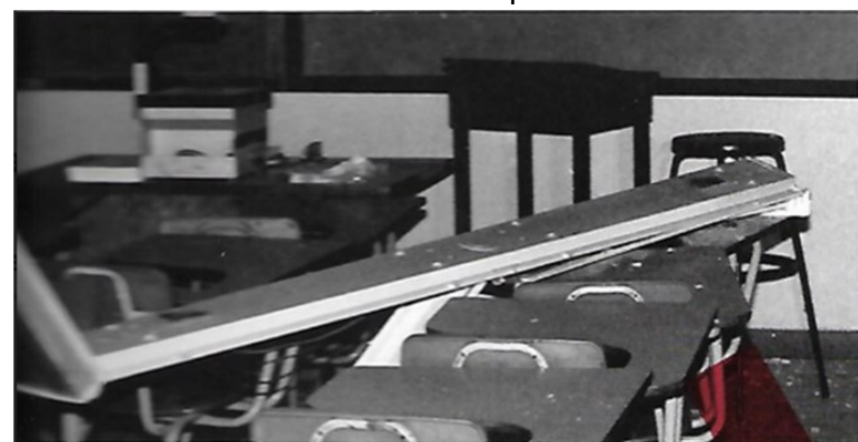
Above: Damage sustained at Whittier High School during the 1987 Whittier Narrows Earthquake, from the 1988 Yearbook.

In 1933 the Long Beach Earthquake resulted in closure of the original auditorium that would later become the library. In more recent years, the 1987 Whittier Narrows quake closed campus for several weeks and many buildings, including the library and auditorium, for much longer. When combined with effects of the 1971 Sylmar and 1994 Northridge earthquakes it resulted in the reconstruction or refurbishment of almost every building on campus, a process that continued well into the 21 st century.