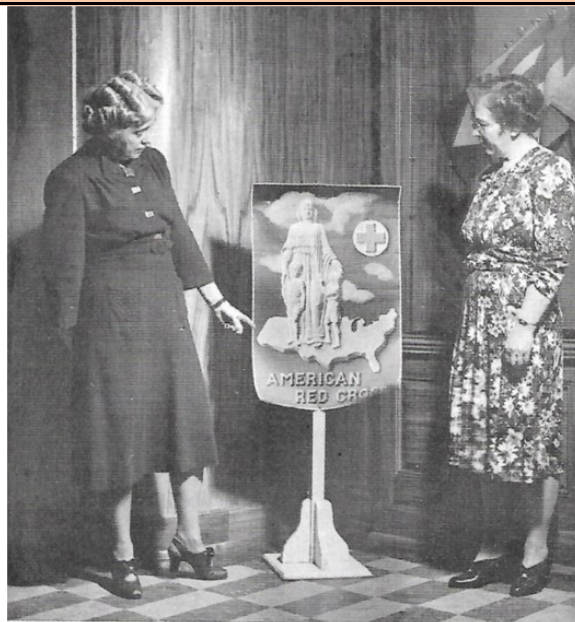
Above: Teachers admiring a Red Cross display, 1942 Left: Whittier High School's service flag, 1944