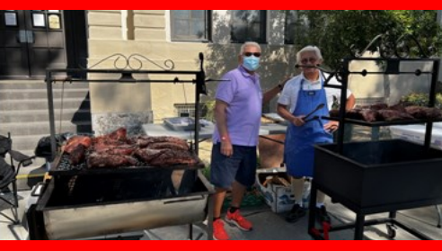
At the Annual All Class Reunion BBQ